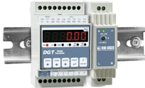
DGT1 with DR1512 optional power supplier, for DIN bar