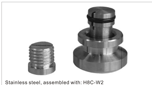
Stainless steel, assembled with: H8C-W2

Easy installation, adjustable height, automatically centralized inside. Stainless steel construction, anti-corrosion, can be used under hazardous environments. Mainly used for platform scales and other electronic weighing devices under hazardous environments.